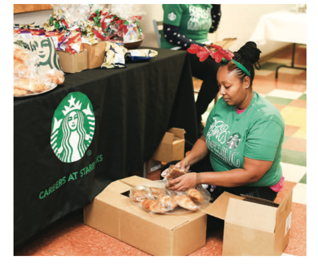
TBHC and Starbucks recently partnered for the first time to sponsor a toy drive and help support our neonatal intensive care unit's (NICU) annual party for its "graduates." Starbucks stores across New York City collected toys from employees to create holiday giveaways and baskets for babies, children and families. Children received such goodies as teddy bears, dolls and books.

Our wonderful Community Advisory Board (CAB) in collaboration with First Calvary Baptist Church (located in Stuyvesant Heights) brought over tons of donated toys, while the choir from the church joined in on the fun. The choir sang holiday carols around the brimming tree in the hospital's main lobby to the delight of visitors and staff.