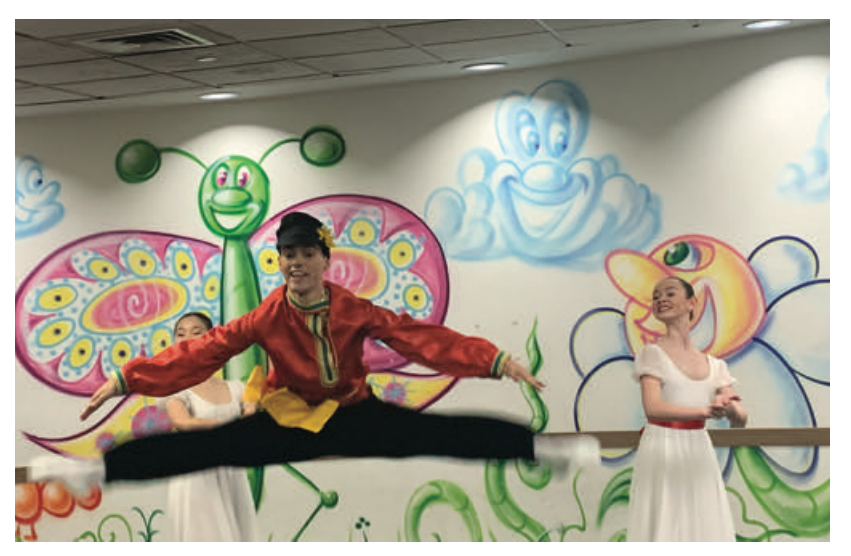
In support of Crafting for a Cure , the Joffrey Ballet partnered with our Children's Health Center to put on a little show. Candy canes, a sugar plum fairy, a nutcracker and this toy soldier all made dance appearances to the delight of our youngest patients!

Interested in joining the TBHC team? Visit our Careers page online at tbh.org/careers.