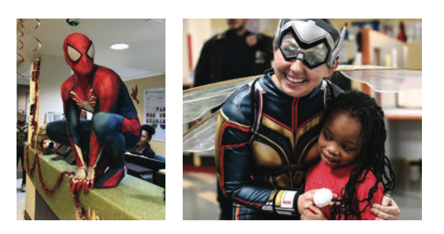
New York Police Department's Patrol Borough Brooklyn North dressed as superheroes for their annual holiday toy giveaway, stopping throughout the borough to the delight of grownups and kids. We were fortunate to be on their route! Spiderman and friends visited and popped up in unexpected places!

December arrives and it's party party at TBHC, thanks to the many community groups who make our patients' days in the hospital more joyful: