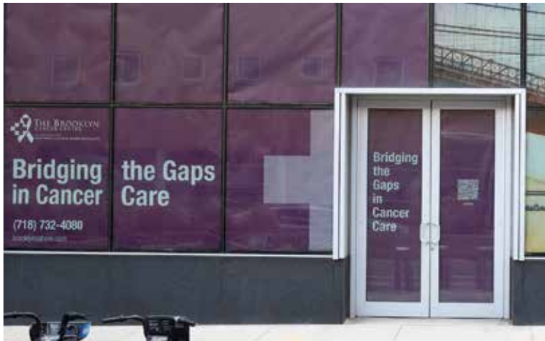
NEW WINDOW SIGNS ANNOUNCE THE UPCOMING ARRIVAL OF THE BROOKLYN CANCER CENTER